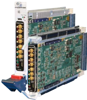
Model 52141CORS (left) and Rugged versions